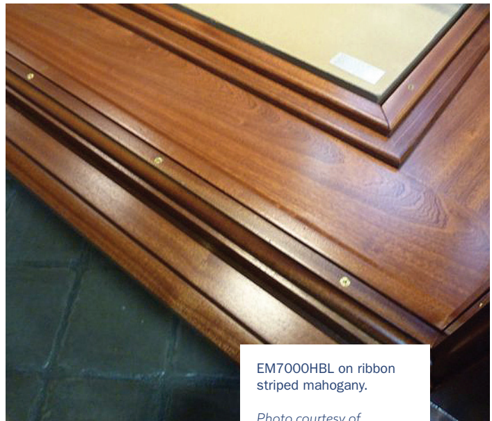
EM7000HBL on ribbon striped mahogany.